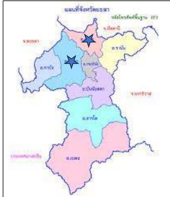
Map of Thailand showing the location of Yala and Map of Yala. The areas marked with stars are our targeted area (Na Tham in Mueng District and Yaha in Yaha district)

5. Activities: RfP Thailand and IHRP use the fund for the organization of 1) a series of capacity building/vocational training workshops for a group of targeted youth, training them to be able to build a small business enterprise producing Batik/tie-dyed handicrafts/ souvenirs and 2) interaction platform/activity for the targeted youths to interact with other youth groups in Yala, possibly the Yala Youth Council and some other youth networks set up by the civil society or the government agencies of the deep south.