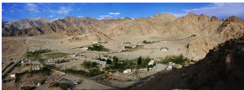
Aerial View of Mahabodhi International Meditation Centre (MIMC)

For the past several years, he has made determined efforts to provide high quality education and safe shelter for underprivileged children and compassionate healthcare for the sick and the needy. He has started empowerment and literacy programmes for women folk and other socially disadvantaged groups.