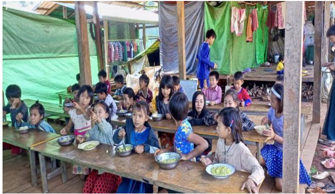
November2022.Rfp- M@KayahGroup: Children from IDP camps enjoying rice porridge after psychosocial support session.

volunteers are to transport these materials through the many check points and scrutinizing of the SAC military. They have to work in low profile by not mentioning the name of organization and project activities and disguised as donors to needy or as traders for sale. Sometimes, religious leaders and some local armed group had supported for smooth flow of materials transportation.