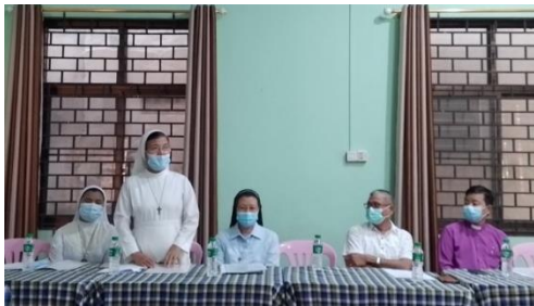
May2022.RfP-M@KayahGroup: Child Protection and Child Rights awareness raising session with Islam leaders, at Islam religious site in Loikaw, Kayah State

RfP-M staff and volunteers were also provided with Child Protection Case Management training to support for referring CP cases to the service providers.