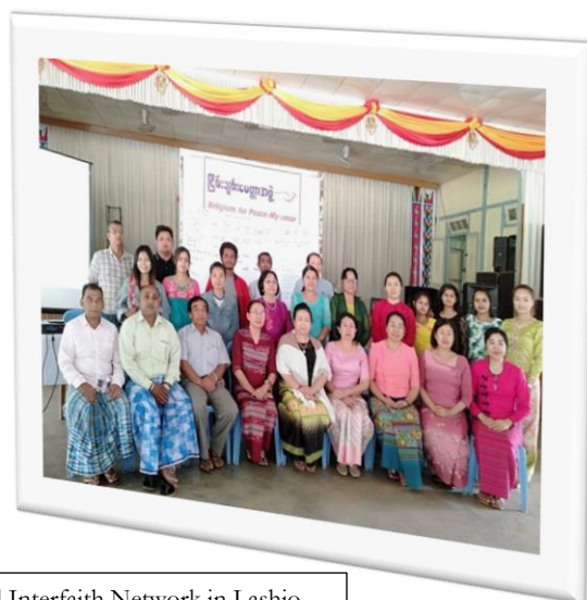
Fig 10 & 11: Meeting on forming Interfaith Committee and Interfaith Network in Lashio.