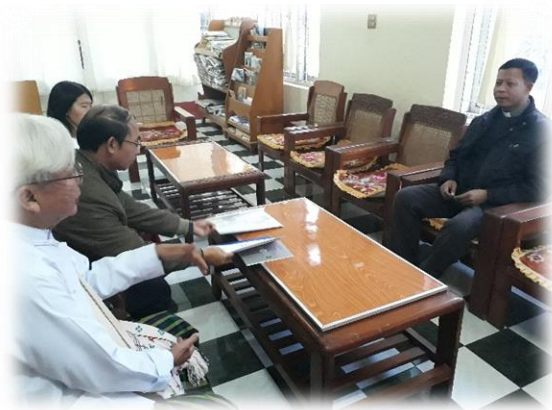
Figure 16: RfP-M team met Muslim Community leaders, Lashio, Northern Shan State.