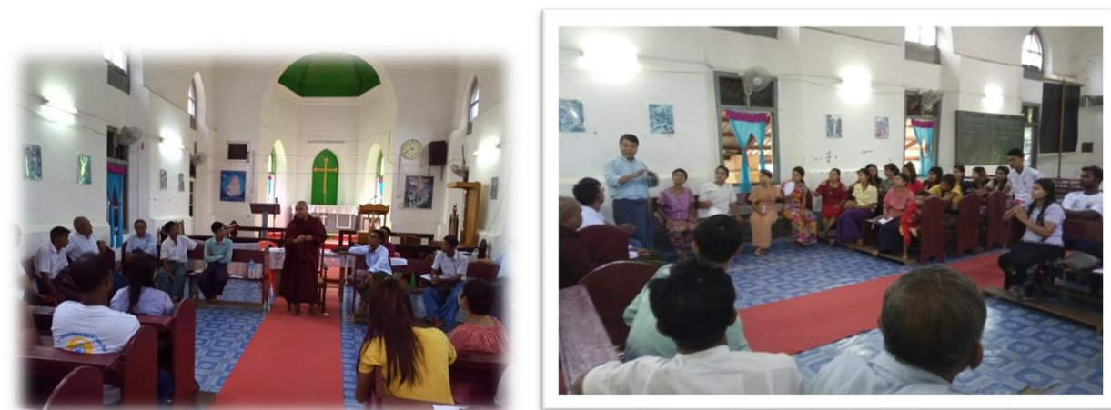
Fig 14 & 15: Regular Leadership Meeting at Sittwe, Rakhine.