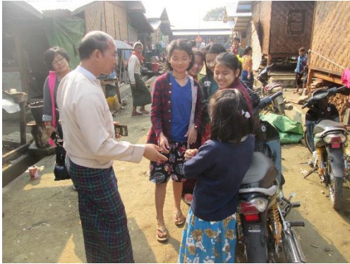
Figure 9: meeting with youth from RC IDP camp, Tanai, Kachin State.

state discussion has been conducted to overcome the challenges of IDPs. Future RfP -Myanmar activity in Tanai is one of agendas that had been discussed with the leaders. Vocational trainings are most requested from IDP youth and women. Similar activities from other areas will be implemented in Tanai such as sewing, nursery teachers and repairing motorbikes trainings. IDPs said that returning to their home villages and working is not secure because of landmine.