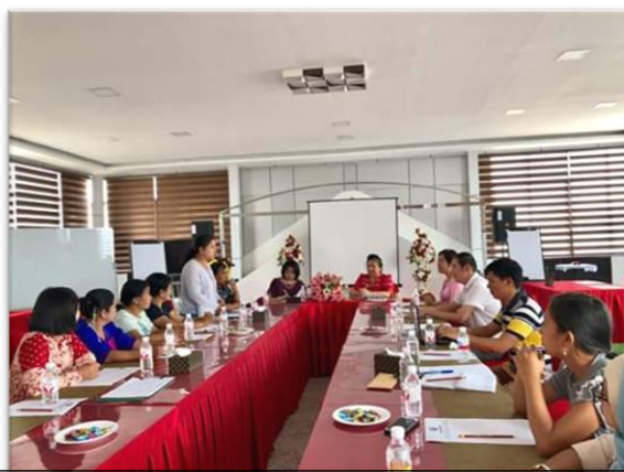
Having Regular leadership meeting for the Month of March, Lashio.