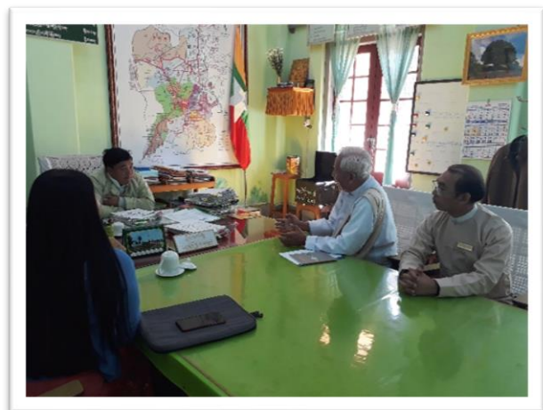
Figure 18: RfP-M team met District Administrator, Lashio, Northern Shan State.