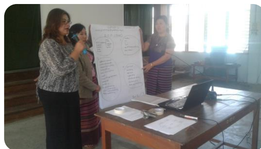
Photos from Do No Harm and Conflict Sensitivity Training, 14 th , 15 th and 16 th January 2020, Pyay