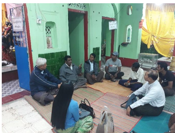
Figure 22: RfP-M team met Hindu leaders, Sittwe, Rakhine State. 12-Feb-2019 (Group 1).