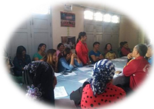
Photos from operationalize regular leadership meeting, MKN, Nov 2019.