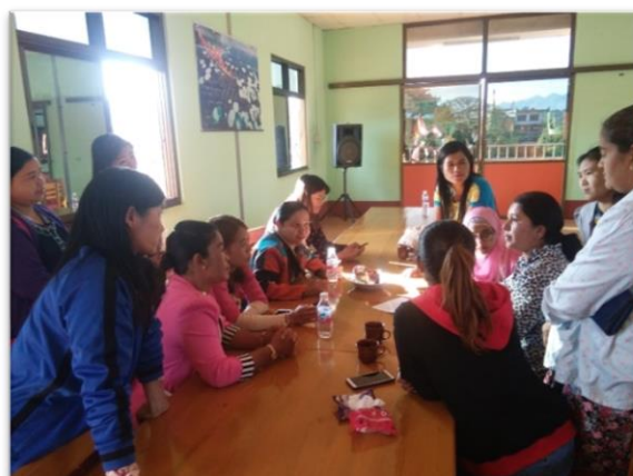
Figure 6: Preparatory discussion on community forum in regular leadership meeting, Lashio, Northern Shan.