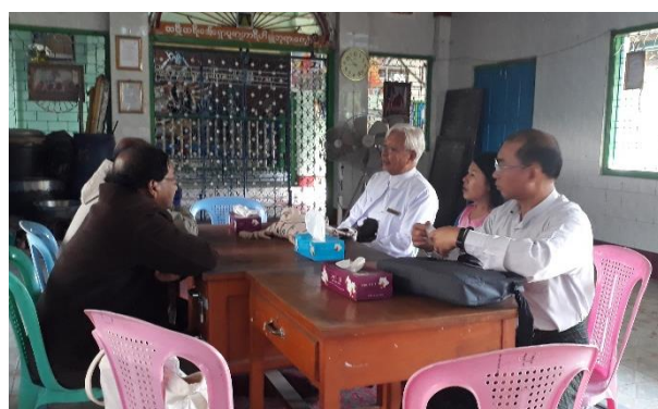
Figure 23: RfP-M team met Hindu leaders, Sittwe, Rakhine State. 13-Feb-2019 (Group 2).