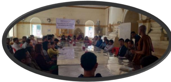
Photos from coordination and networking meeting in Sittwe, Dec 2019.