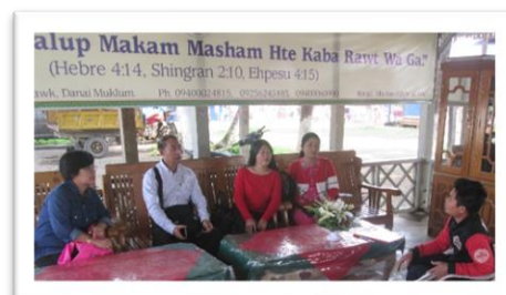
Figure 6: meeting with KBC IDP camp in-charge, Tanai, Kachin State.