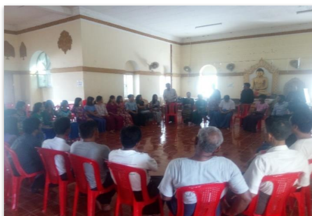
Figure 1: Having Interfaith Dialogue session at Shwezadi Monastery on 15 th Feb 2020, Sittwe, Rakhine State.