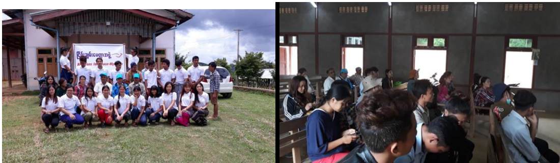
Photos from Planting and visit to religious side activity, Lashio