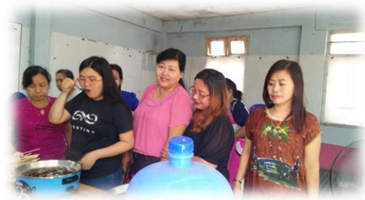
Photos by Korea food production from the result of financial literacy awareness workshop