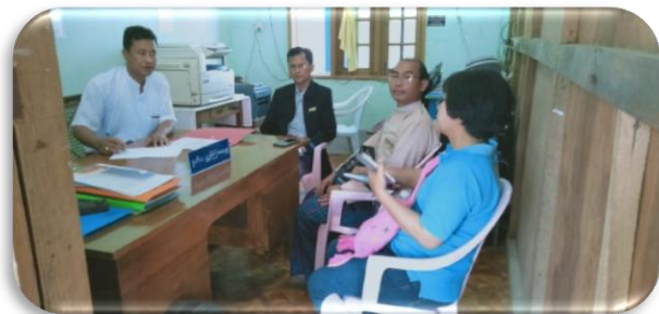
Figure 11 & 12: RfP -M staff and IC members met local authority at Myitkyina