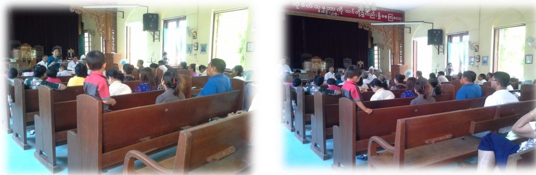
Figure 24&25: Conducting Strengthening meeting with IC, WoFN and IYN in Pyay.