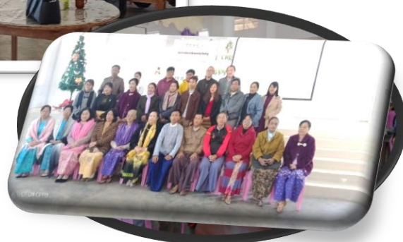
Photos from coordination and networking meeting in Lashio, Dec 2019