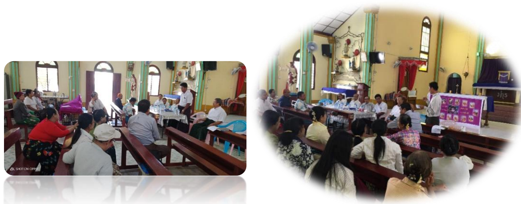
Photos from Regular Leadership meeting, Pyay