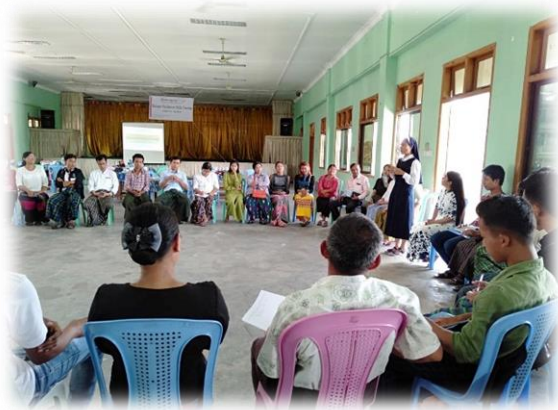
Photo of Practical dialogue