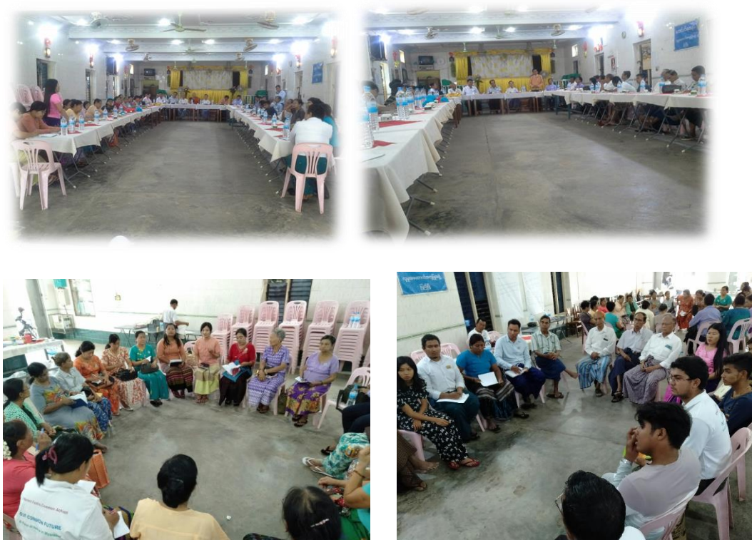
Figure 26,27, 28 & 29: Conducting Interfaith Dialogue Session in Pyay.

To conduct dialogue sessions in Myitkyina and Lashio is in the process. Community interfaith dialogue on dialogue methodology is new term for them and it is needed to discuss again and again in order to capture the process of dialogue session. The members from Pyay, have aware on dialogue facilitation skill and conflict analysis and reconciliation from the implementing of the last project with USAID, Kann Let (DAI). Dialogue sessions in another three areas Myitkyina, Lashio and Sittwe