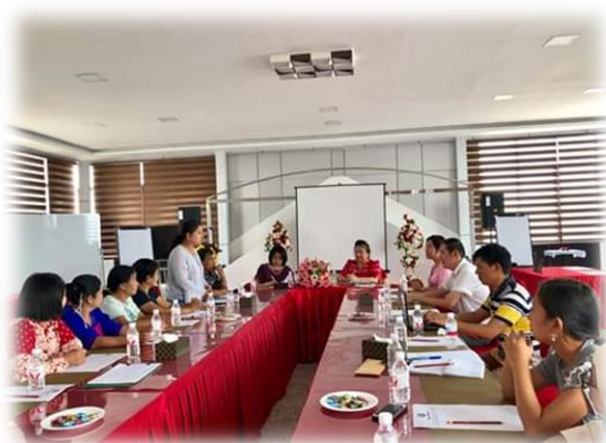
Photos from Regular leadership meeting, Lashio