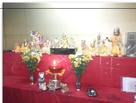
Table 7: After regular leadership meeting, visited Hindu Temple, Lashio.