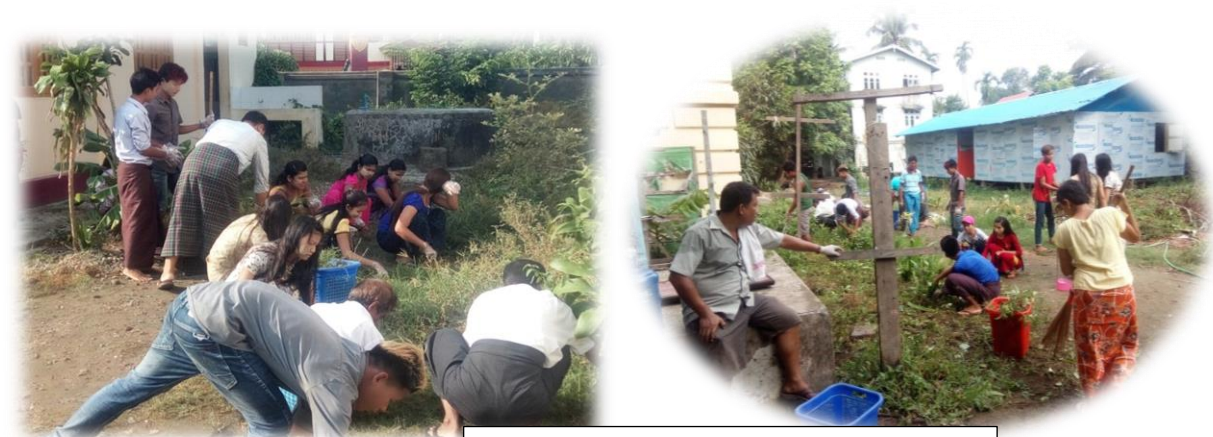
Fig 20 နှင့် 21: Cleaning campaign in Sittwe.