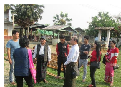
Figure 8: meeting with Religious leaders and Camp in-charge at KBC IDP camp, Tanai, Kachin State.