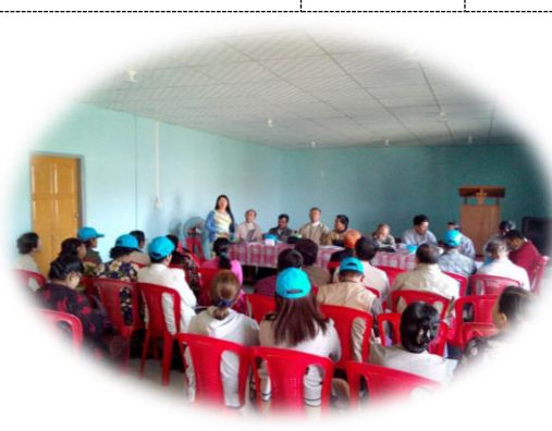
Figure 1 & 2. Conducting Inception meeting with Interfaith Community in Pyay.