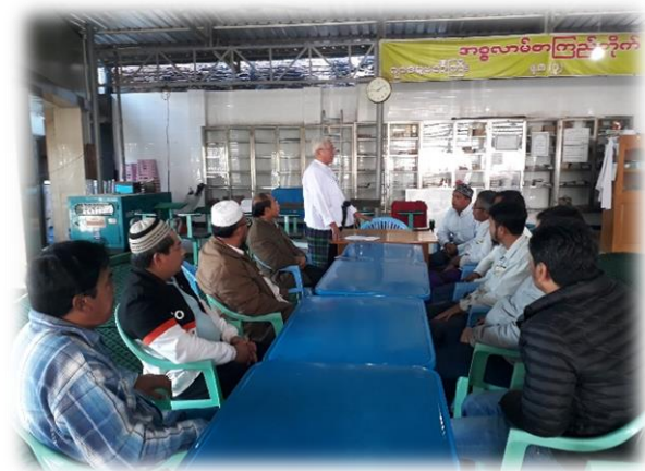
Lashio, Northern Shan State.