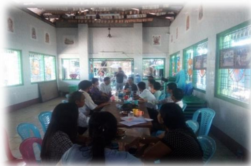
Photos from regular leadership meeting in Sittwe, Oct 2019.