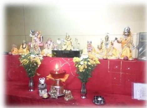
This photo is visiting Hindu religious side. Regular leadership meeting in March