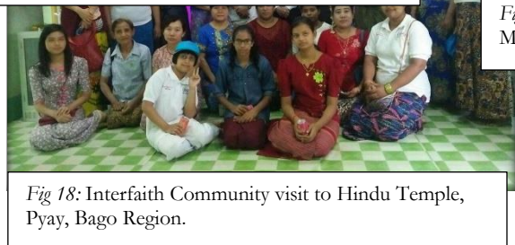
Fig 18: Interfaith Community visit to Hindu Temple, Pyay, Bago Region.