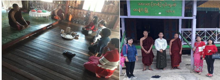
Figure 10: Initial meeting with Buddhist religious leaders, Tanai, Kachin State.