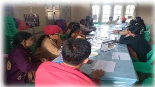
Photos from regular leadership meeting, Myitkyina, Feb 2020