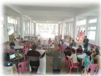
Photos from financial literacy awareness workshop in Lashio, Dec 2019