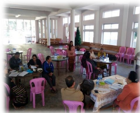
Photos from regular leadership in Lashio, Nov 2019.