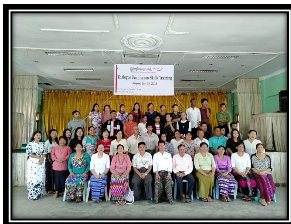
Group discussion and group photos in Dialogue Facilitation Skills training, Myitkyina, August 2019.