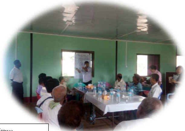
Fig 8 & 9: Meeting on forming Interfaith Network in Sittwe.