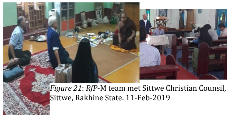
Figure 21: RfP-M team met Sittwe Christian Council, Sittwe, Rakhine State. 11-Feb-2019