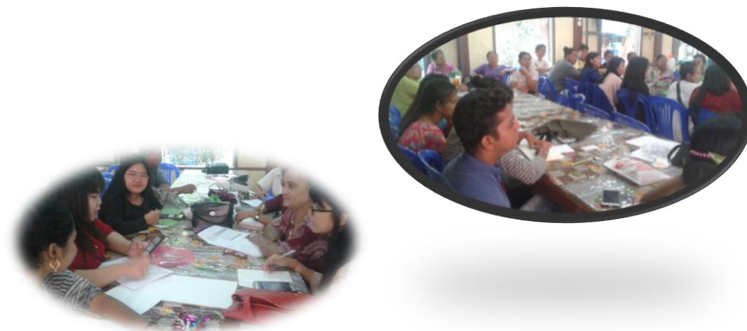
Photos from Financial Literacy and income generating support through women workshop in Pyay, Nov 2019.