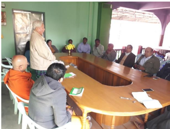
Figure 14: RfP-M team met Hindu leaders, Lashio, Northern Shan State.

President, Program Manager and Project Coordinator have separated meeting with religious leaders from Buddhist, Hindu, Christian and Islam at their respective place, from the Christian both Catholic and Lashio Christian Council (LCC) and Sittwe Christian Council (SCC). President, RfP-M explained about detail process of RfP-M and how it was born in Myanmar and who we are and what we are working for with the different religious communities.