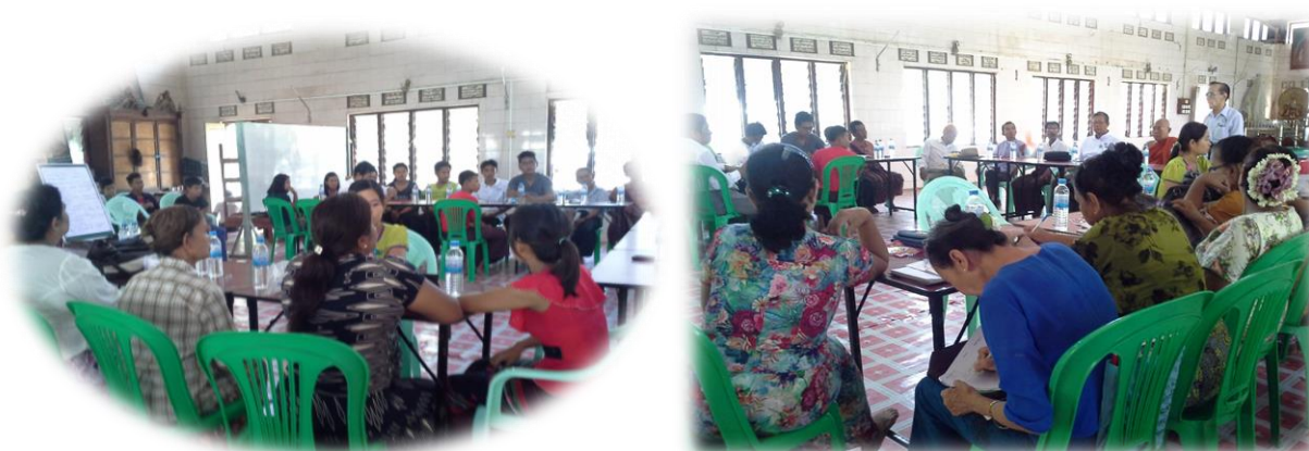
Fig 12 & 13: Regular Leadership Meeting at Pyay.