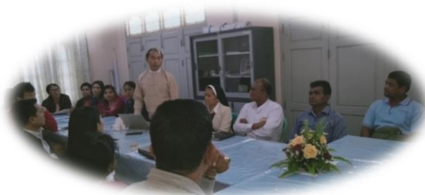
Figure 3 & 4: Conducting Inception meeting with interfaith community in Myitkyina, Kachin State.