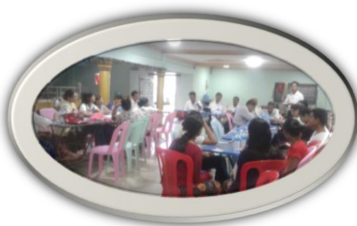
The photo from Pyay, Regular Leadership Meeting

Religions for Peace-M held Monthly Meeting with IC/Religious leaders, WoFN and IYN in Buddha Nuggaha Dhammacari Dhammayone, Pyay on 13 th October 2018. The leaders of different religious groups, the members of WoFN, IYN, RfP -M’s local staffs and guests from the Department of Religion, West Bago and No.1 Police Station attended the meeting.