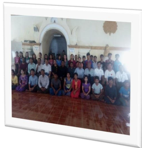
Photos from Inter and Intra faith dialogue session in Sittwe, Rakhine State.