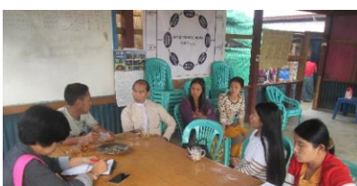
Figure 7: meeting with Catholic IDP camp in-charge, Tanai, Kachin State.

R/P-M which is situated in Redo road/ma road about 117 miles far from tkyina with zigzag road. IDP camps in ai is one of the places that Social Welfare, pyitaw mentioned support needed from nizations. Since April 2018, because of ed conflict between the Tatmadaw and the hin Independence Army (KIA) many eople had fled their homes and placed Catholic and KBC church compound in Tanai Township as IDPs. There are 645 IDPs in Catholic IDP camp and 400 plus in KBC IDP camp. R/P-M staff met religious leaders and IDP ca in-charges and initial