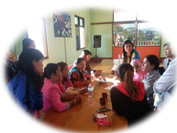
Photos from preparation and regular leadership meeting for community forum.