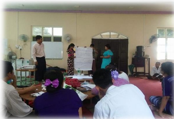
The photos from Peace Education training, Pyay