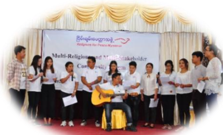
Photos from Community Forum in Lashio, 25 th Feb 2020.