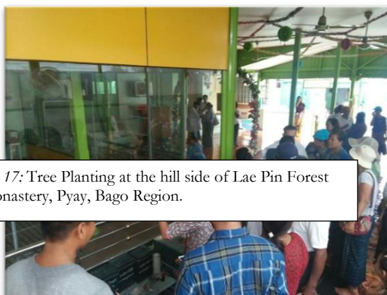
Fig 17: Tree Planting at the hill side of Lae Pin Forest Monastery, Pyay, Bago Region.