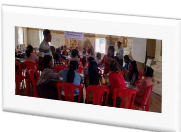
Photos from Financial Literacy Awareness workshop in Sittwe, Dec 2019.