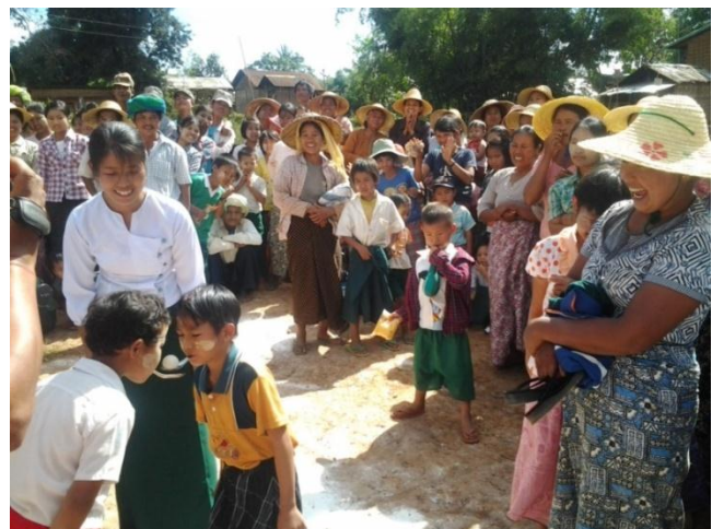
Parents and village community look on excitedly over a competition of a passing game at the CRC day celebration in Nyaung Kha Shay village, Southern Shan State, Myanmar, organized by RfP-M and its partner Karuna Myanmar Social Services (KMSS).