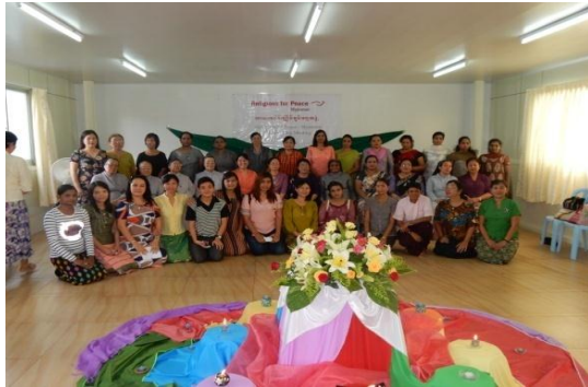
WOFN members from all four religions seen at the prayer session organized by Catholic faith, at the Good Shepherd sisters' convent premises on 2 July 2015, Yangon.