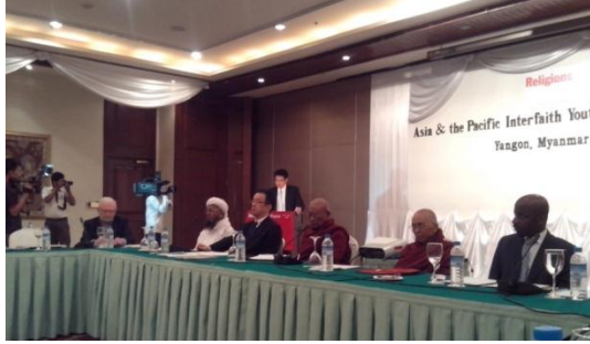
Religions for Peace International officials seen at the Asia and Pacific Youth Network forum in Yangon, at Chatrium hotel, 2013.