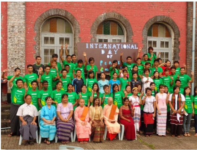
RfP-M and Interfaith Youth Network jointly commemorate the International Peace Day in September 2014 at the premises of Catholic Bishops Conference of Myanmar (CBCM), Yangon.