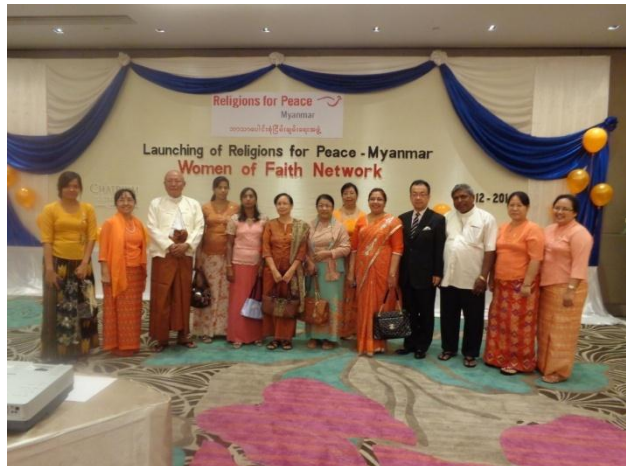
WOFN members and RfP-M Core members seen at the launching of Religions for Peace Myanmar, Women of Faith Network on 2 nd December 2014 at the Chatrium hotel.