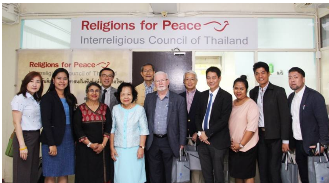
ACRP Team visited Interreligious Council of Thailand at Mahidol University

ACRP secretariat had the first enlarged secretariat's meeting in which Moderator, Deputy Moderator, SG, ASGs, Senior advisor and all secretariat staff members participated for the intensive discussion on the governance, management, project implementation and road mapping of ACRP.