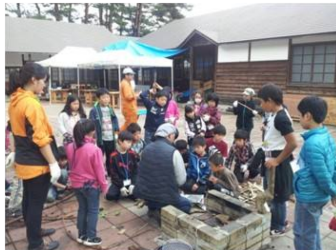
Volunteer activities for reconstru ction and victims