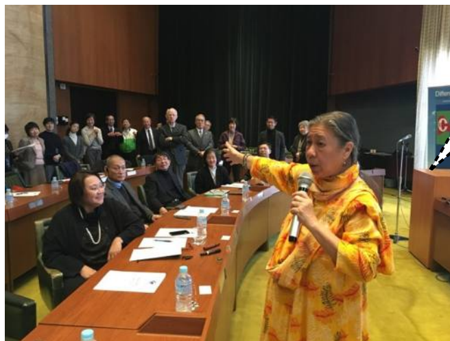
Practical Workshop for Reconciliation