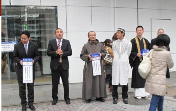
Fundraising on the street