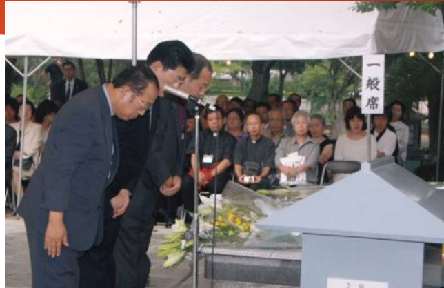
Prayer for A-Bomb victims in Hiroshima and Nagasaki