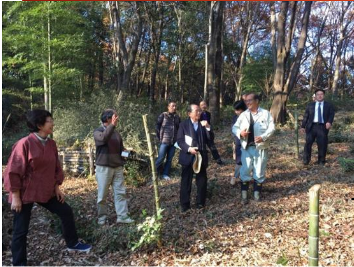
Forest Planting Project near Tokyo