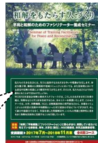
Training Seminar for Trainers of Reconciliation