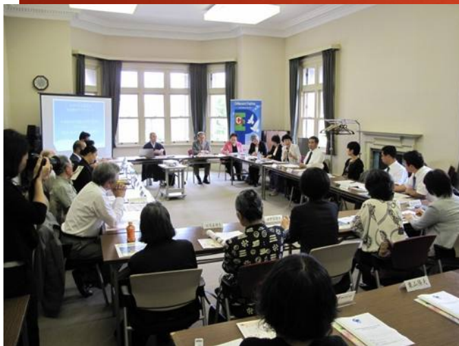
Roundtable conference for development of Peace Education