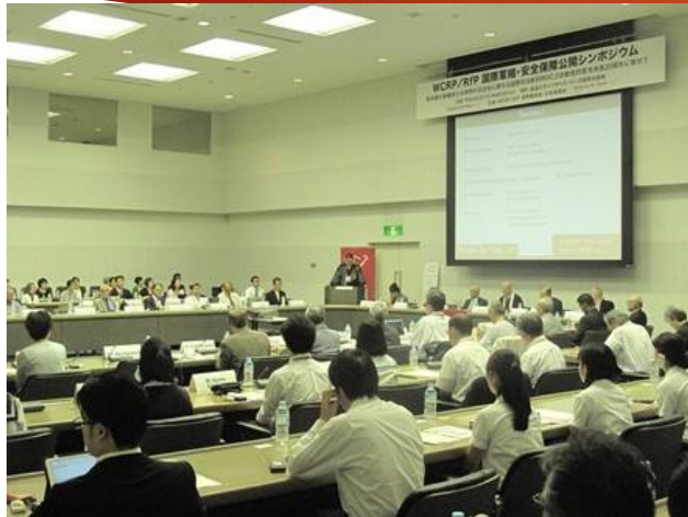
International Conference for Disarmament