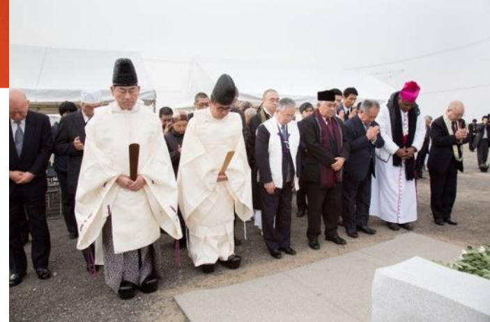
Multi Religions Prayer